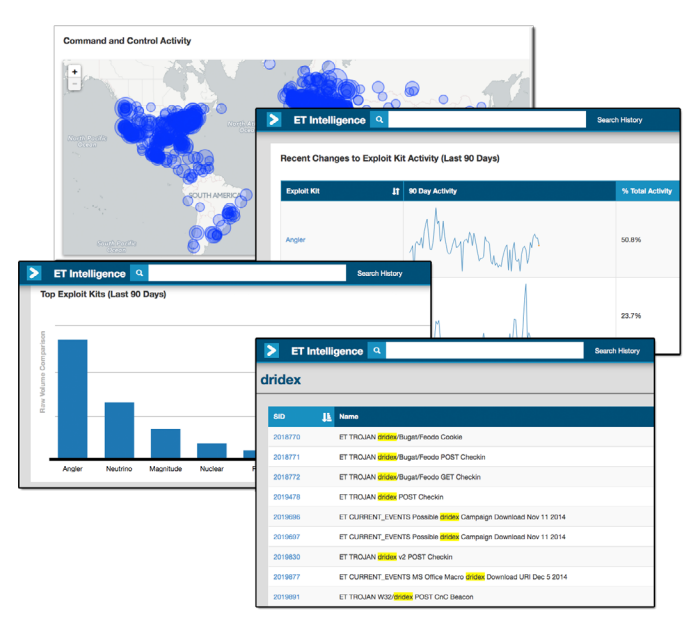
Proofpoint ET Intelligence Global Threat Database